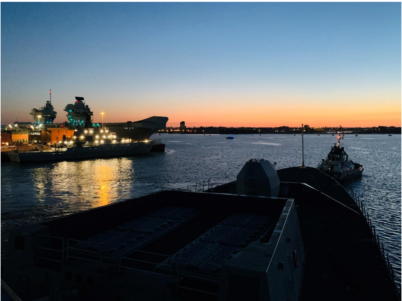
HMS Defender leaving Portsmouth

Defender is earmarked for upcoming missions in the Mediterranean, Middle East and Asia-Pacific region on HMS Queen Elizabeth's Carrier Strike Group 21 mission.