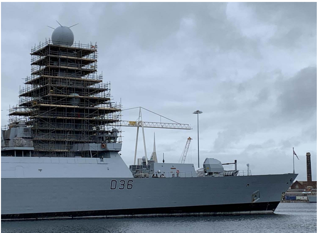
HMS Defender during maintenance period in Portsmouth

The Type 45 then headed for extensive top-to-bottom maintenance ahead of a busy 2021, including capability upgrades being fitted, a fresh coat of paint and routine upkeep on the exterior of the state-of-the-art multifunction radar, which required a massive 80 tonnes of scaffolding to access it. Defender also went into dry dock so the ship’s underwater fixtures could be maintained.