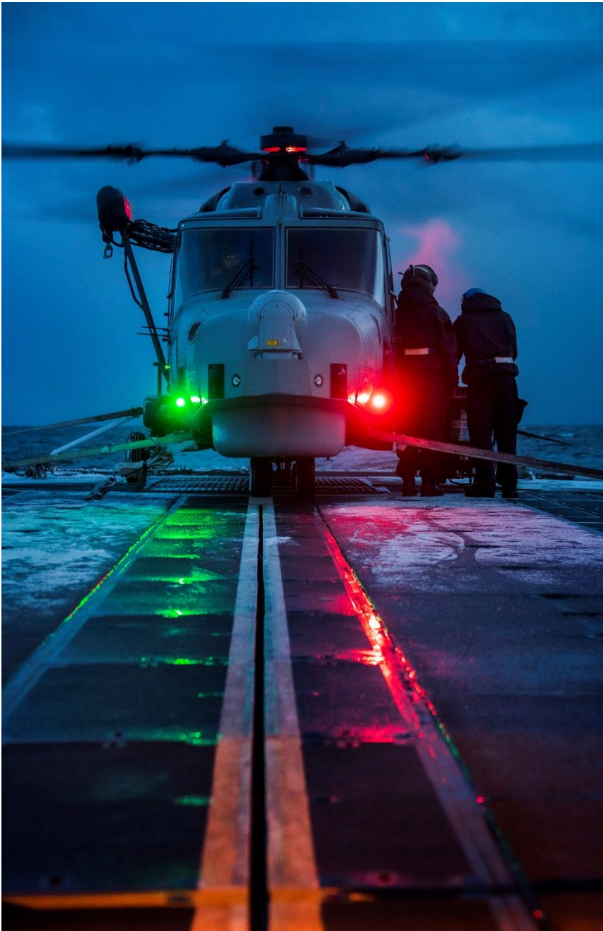
Lancaster's flight deck handlers lash her Wildcat to an icy flight deck

The British ships underwent a week of 'full-throttle' individual and combined training in the North Sea on their way to join their Baltic allies.