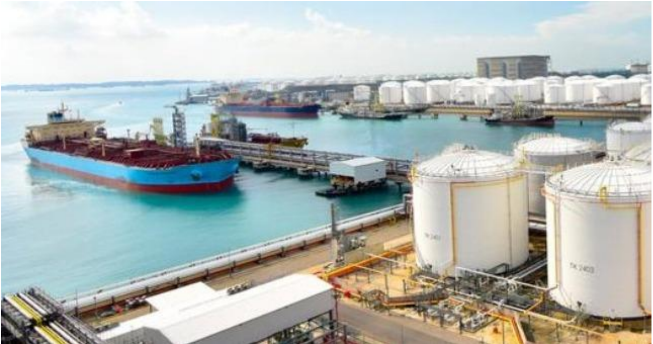
Itochu and Vopak in a separate agreement are studying the feasibility of developing infrastructure in Singapore

The initiative is being led by the Japanese trading company ITOCHU Corporation and its fuel trading operation ITOCHU ENEX Co. They will be working in collaboration with Ube Industries, which is one of the largest producers of ammonia in Japan, and Uyeno Transtech, one of the largest owners and operators of vessels domestically in Japan.