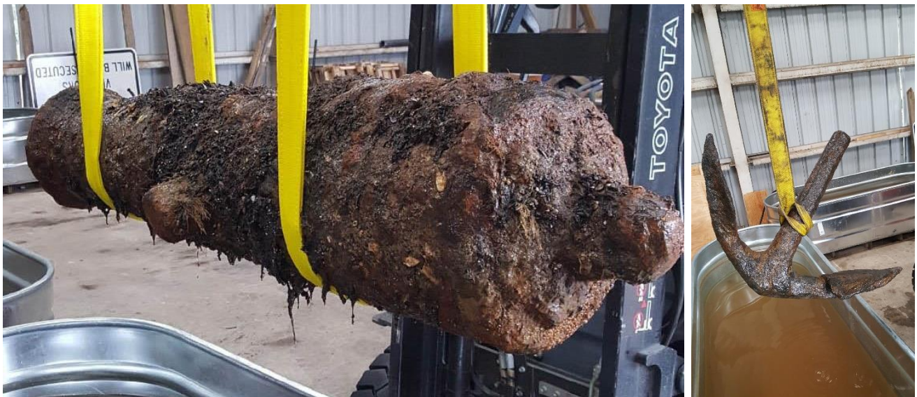
An encrusted cannon and part of an anchor

Cannon, an anchor and other objects – thought to belong to HMS Rose – were dredged from the bed of the Savannah River, nearly 250 years after the ship was scuttled at the height of the conflict.