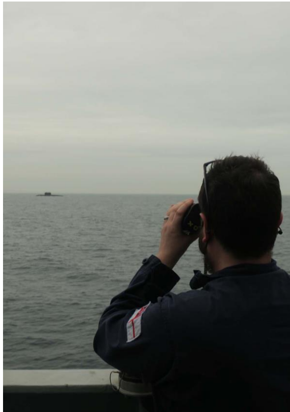
Monitoring the submarine