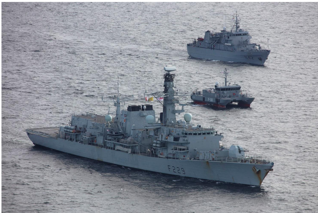
HMS Lancaster sails in the Baltic in close company with Lithuania's LNS Jotvingus (top) and Latvian Ship LVNS Jelgava (centre)