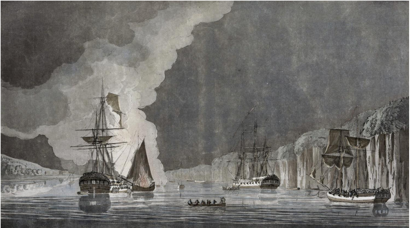
A contemporary engraving of HMS Phoenix and Rose engaged by enemy fireships on the Hudson in Aug 1776

The British vessel also frequently conducted forays up the Hudson River (depicted below in a contemporary engraving) which helped to drive George Washington out of New York when war broke out and continued to patrol the Eastern Seaboard until the decision to use her as a blockship off Savannah.